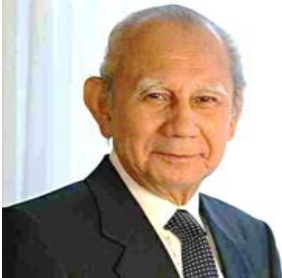
Prof. Dr. Emil Salim Chairman, Economic & Environment Division, Council of Advisors to the President, Jakarta, Indonesia emilsalim2002@yahoo.com